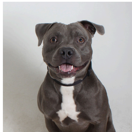
Pet of the Week Beckham

Your sponsorship provides vital support for a homeless animal and enhances your business's visibility and commitment to animal welfare. You will help shine a light on the urgent need for adoption and encourage community members to consider bringing a new furry friend into their lives. Together, we can create a positive impact in our community, leading to more animals finding forever homes. Join us in this important mission—sponsor a Pet of the Week today!